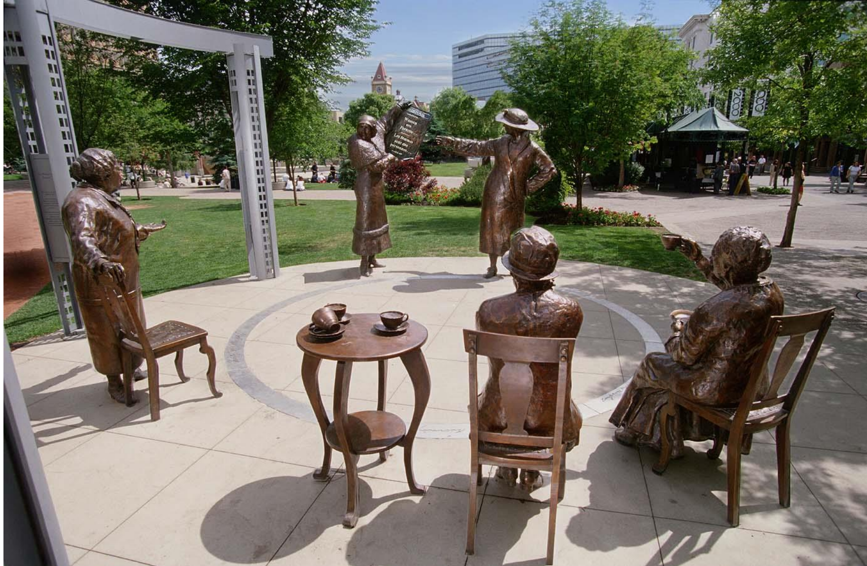
Monument on the grounds of Parliament Hill in Ottawa unveiled in 2000 to commemorate the Persons Case and the Famous Five – Emily Murphy, Nellie McClung, Irene Parlby, Louise McKinney and Henrietta Muir Edwards.